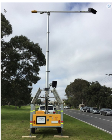
A Distracted Driving camera operating during the trial.

A trial of the system in Victoria in 2020 checked 679,438 cars in three months using just two portable cameras. Around one in 42 vehicles, or 16,000 drivers, were detected using a mobile phone. Extrapolate those figures over the course of a year, and we could see more than 64,000 infringements. Remember the current fine is $555.00 therefore \$555.00 \times 64,000 is $35,520,000.